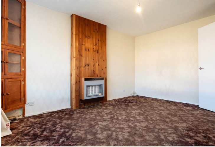
5'5 z 5'2